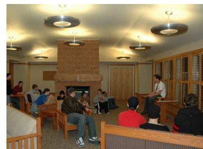
Gateway Heights Lounge