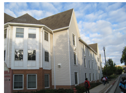
Chapel Glen Exterior